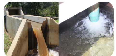
Water before and after treatment

The water undergoes lab test to confirm that the water is safe for human consumption.