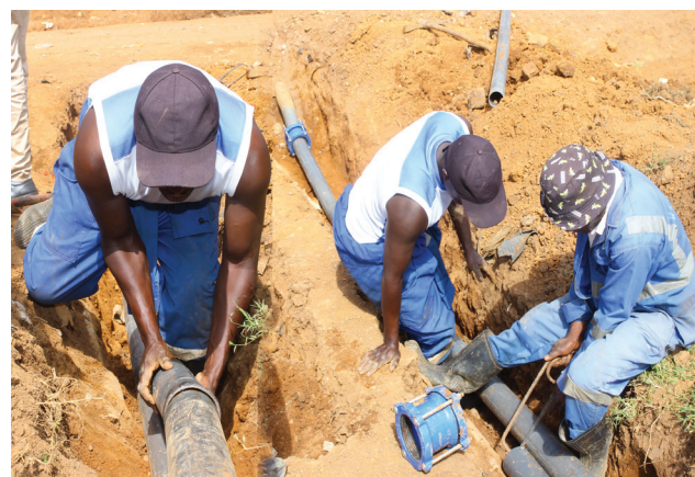
KACWASCO team fixing pipes at Amalemba Estate

He noted that were it not for the challenge