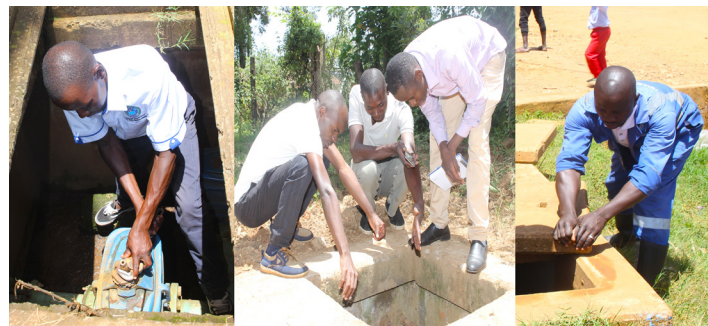
Controls team at work