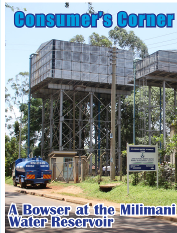
A Bowser at the Milimani Water Reservoir

"I have to be vigilant when the water is opened at Tin-