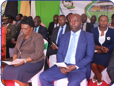
Senior County Officials during the launch of the Musembe Dam Water Project in Lugari Sub County.

ga County Rural Water and Sanitation Company to ensure that poor families were connected to water for free under the programme.