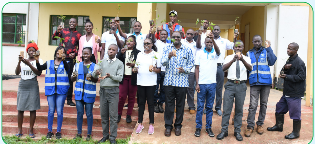
Members of Green Movement pose for a photo after a tree planting exercise at Mukhonje Secodary School

They planted 1,000 indigenous trees at the facility.