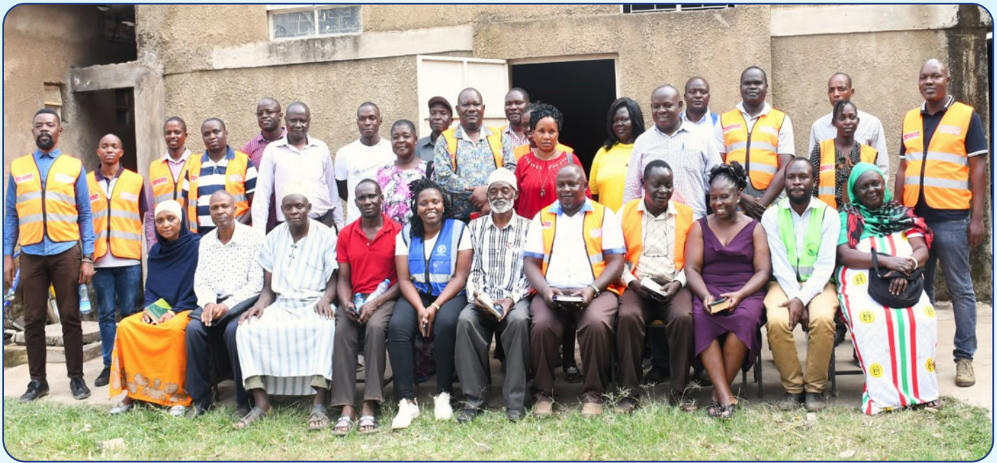
KACWASCO and Kenya Informal Settlements Improvement Project Phase II (KISIP2) consultants after meeting local representatives from selected low income areas of Mumias and Kakamega Municipalities on how to improve water and sanitation services by World Bank.